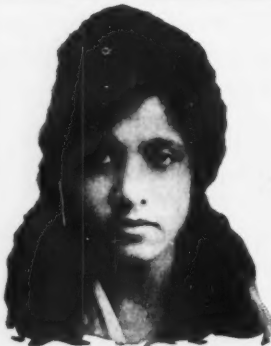
A Kashmir Girl

5 or 10 minutes a day caring for your skin and hair the Kashmir Way will bring wonderful results. You Won't Know Yourself in a few days.